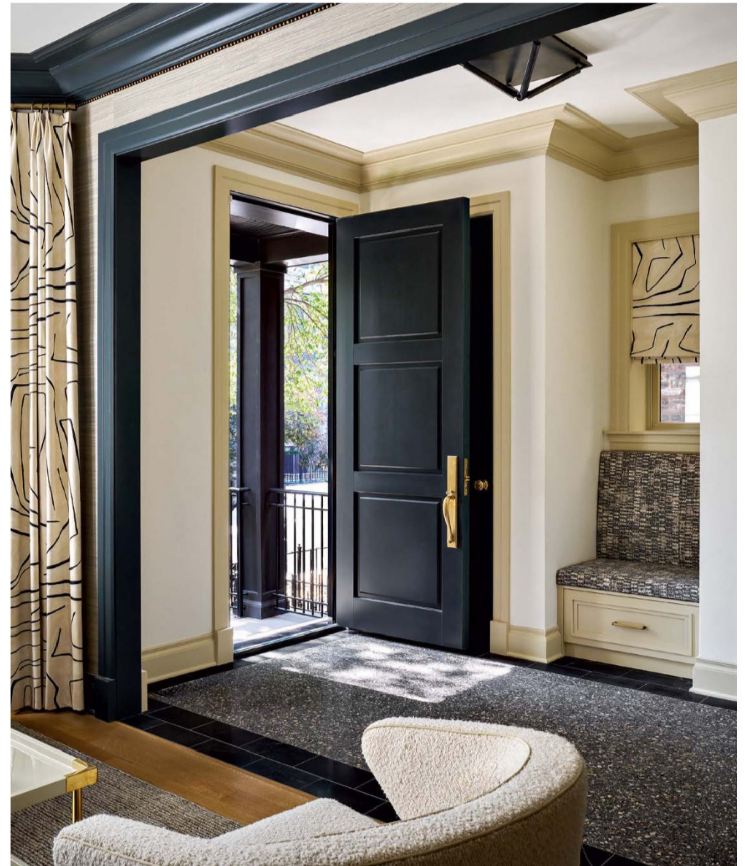
With its terrazzo flooring from The Fine Line and banquette upholstered in a Great Plains fabric by Holly Hunt, the foyer announces the home's mix of historical references and modern finishes. Millwork coated in Crisp Khaki complements walls in Cream Fleece, both by Benjamin Moore.