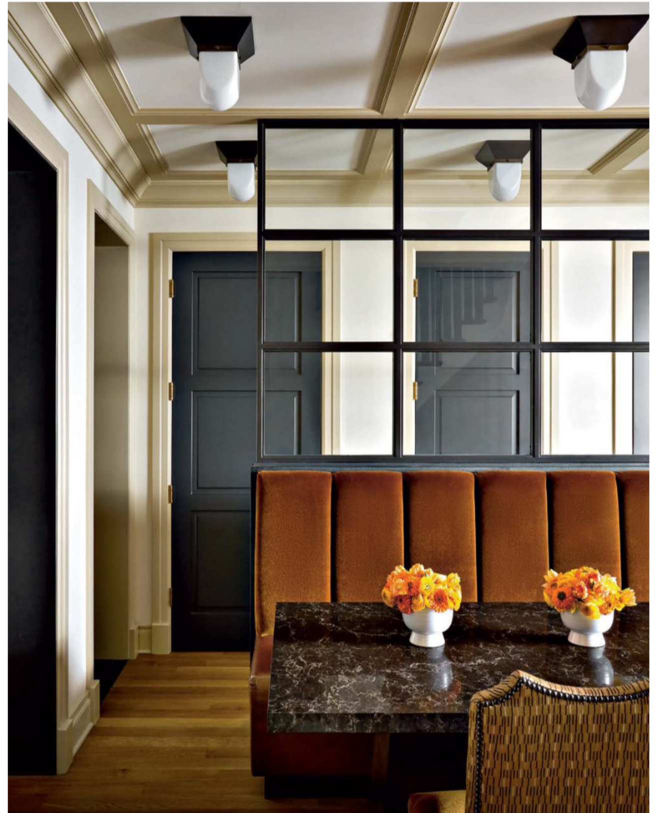
Above: Fabricated by Eurocraft, Inc., the dining room banquette features S. Harris velvet on the channel-tufted back. The table is topped with Caesarstone in Vanilla Noir. Light fixtures by The Urban Electric Co. punctuate the ceiling.