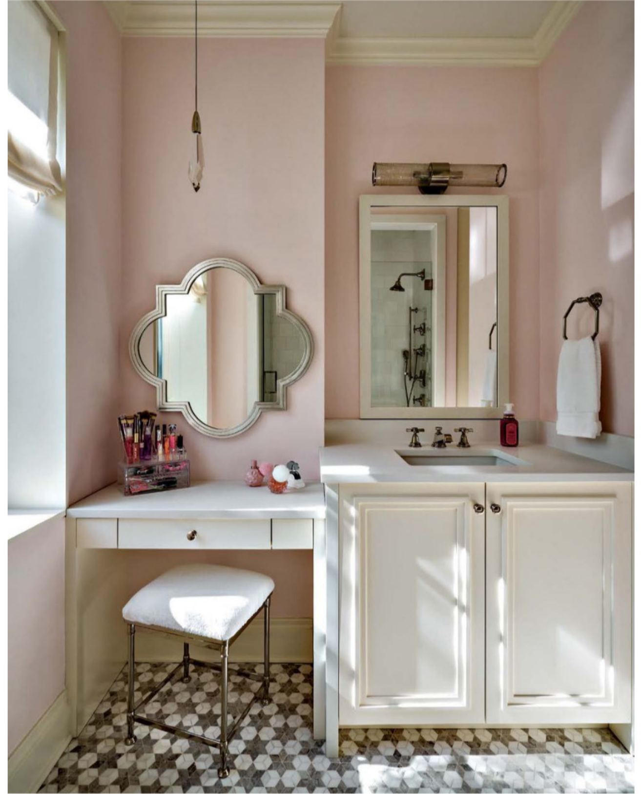
Above: The daughter's bathroom is a study in pink and white, with Caesarstone's Pure White quartz countertops, walls in Benjamin Moore's Pompeii and marble mosaic floors from The Fine Line. A Visual Comfort & Co. sconce and a decorative Mirror Home mirror add shimmer.